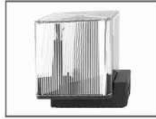
AZ FL 19 Flash Lamp