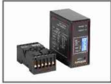
AZ LB 33 Loop Detector