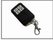
AZ BLDCTX22 Transmitter