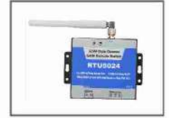
AZ GSM 30 GSM Module