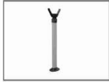
AZ BB VH V Holder