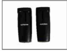
AZ PC 10 Photocell