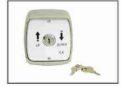
AZ KS 15 Key Switch