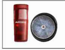
AZ RFPC 43 Reflector Photocell