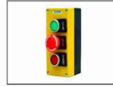
AZ PB 16 A Push Button