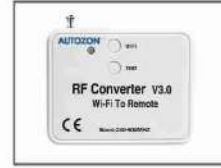
AZ RF WIFI 31A Wifi Module